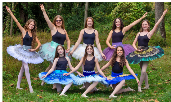
Ballet Company 2023-2024

Friday June 6th & Saturday June 7th, 2025